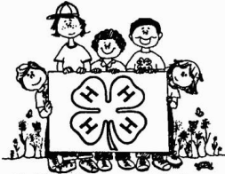
4-H Clover Kids

Clover Kids will meet on Monday, April 4 @ 4:30pm at Leatherman Park We will be having an Easter Egg Hunt!!