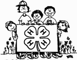
4-H Clover Kids

Clover Kids will meet on Monday, May 8 @ 4:30pm at Leatherman Park End of year party. We will have Bounce House and tons of fun!